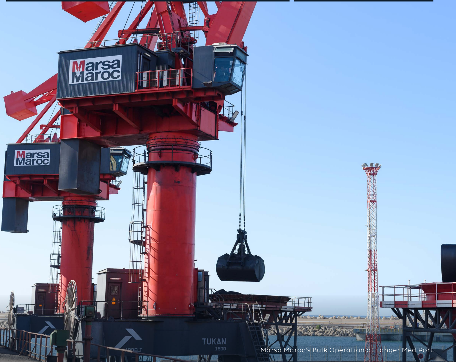
Marsa Maroc's Bulk Operation at Tanger Med Port

AWARDING OF THE "BLUE FLAG" LABEL TO THE "DALIA" AND "AIN DIAB" BEACHES