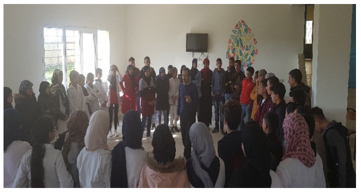
Taghramt School Theater Workshop 25 students from Taghramt College. Partnership, University Action Association of Tangier.

Partnership, Melloussa Association for local development.