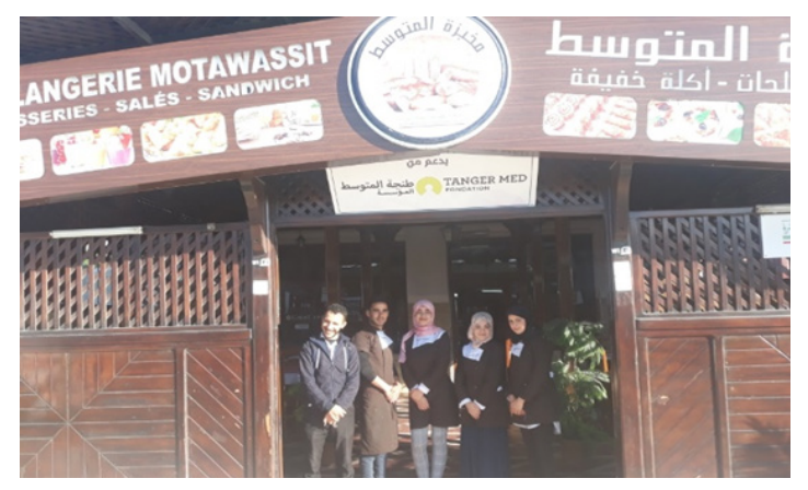
Bakery Al Moutawassit Cooperative Support of fifteen young people from the Municipality Ksar Al Majaz in the creation of a local bakery.

Contribution to a hearing aid distribution operation for 20 hearing impaired students in the Fahs Anjra province.