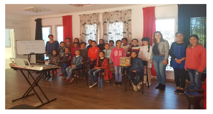
Choral workshop of Melloussa Pilot experience in the area: 22 children from the Melloussa community centre.

Partnership, Melloussa Association for local development.